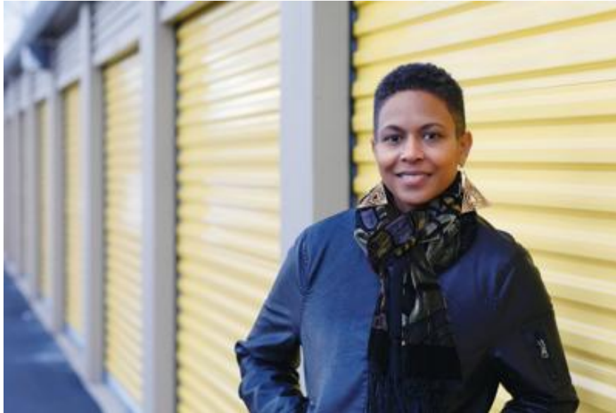
Furnishing Homes & Transforming Lives for Those in Need

Thank you for taking time to review our 2022 Year End Report. This was a very busy year for our small organization. I would like to begin by first expressing my gratitude and appreciation to the UDFL Board of Directors, for all of their efforts throughout the year. Thanks to their work, UDFL gained its first employee...me! I have put my heart, soul, time and energy into the growth and success of this organization since its formation in 2017. Being an employee of UDFL has brought one of my dreams to life and has allowed me to officially earn a living doing what I love and growing as a servant leader. Board members also spearheaded new initiatives to spread awareness about the organization and created systems to help us share data points regarding our key programs and their impact.